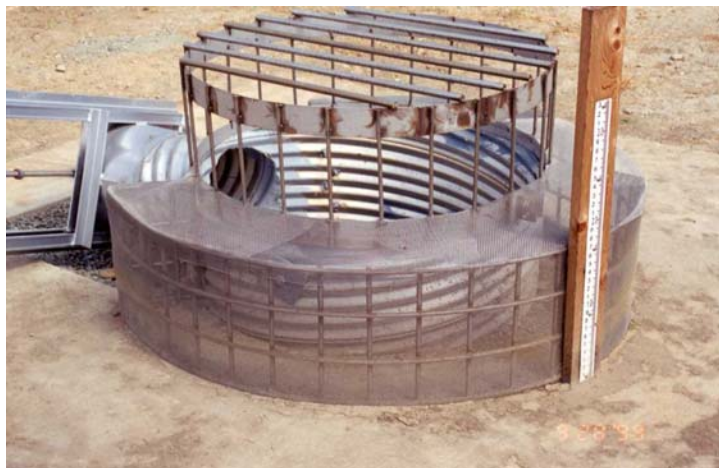
Figure 1 Example of Extended Detention Outlet Structure

The facility's drawdown time should be regulated by an orifice or weir. In general, the outflow structure should have a trash rack or other acceptable means of preventing clogging at the entrance to the outflow pipes. The outlet design implemented by Caltrans in the facilities constructed in San Diego County used an outlet riser with orifices sized to discharge the water quality volume, and the riser overflow height was set to the design storm elevation. A stainless steel screen was placed